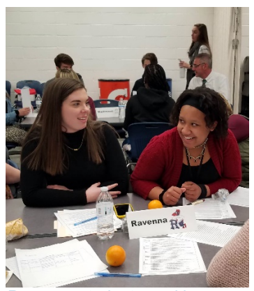
Ravenna students working on their action plan.